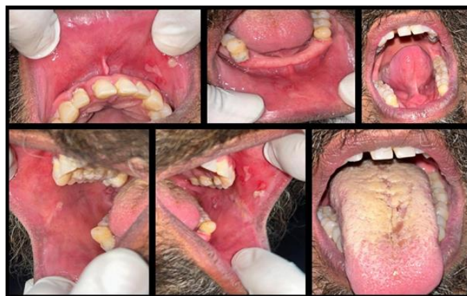
Figure 3: Follow up after 1 month showing, 90-95% regression of erosions in oral mucosa.