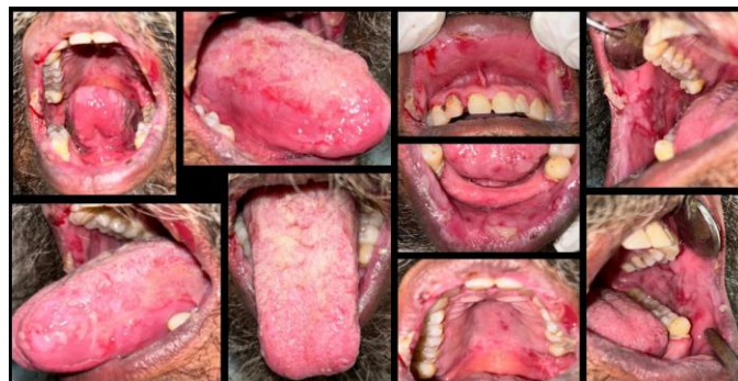
Figure 1: Diffuse ragged erosions involving bilateral buccal mucosa, labial mucosa, lips, tongue and palate with pseudo-membrane at certain sites and erythematous periphery.

Pemphigus Vulgaris being an autoimmune blistering dermatosis with a chronic course requires prompt diagnosis and effective management to avoid severe complications. Ongoing clinical trials exploring FcRn inhibitors, Bruton tyrosine kinase (BTK) inhibitors and T- cell co-stimulation blockers offer promising avenues for more precise, personalized and safer interventions. As our understanding of the disease mechanism evolves, these novel therapies pave the path for improved outcomes and quality of life in patients with pemphigus vulgaris.